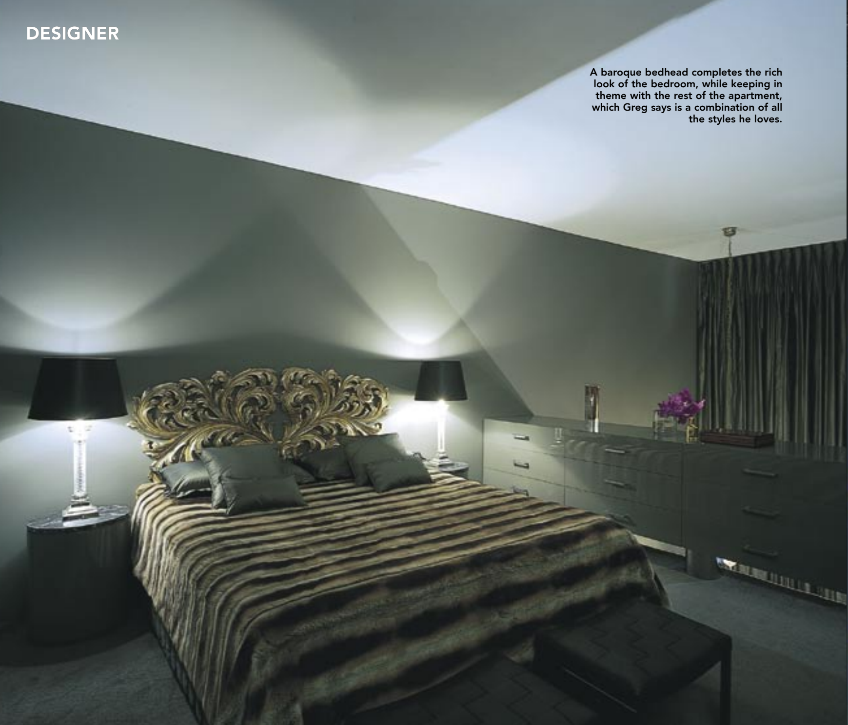
A baroque bedhead completes the rich look of the bedroom, while keeping in theme with the rest of the apartment, which Greg says is a combination of all the styles he loves.

it, I had thought it was bad taste. My parents were new immigrants and had recently built their dream home and had purchased all this kitsch baroque furniture. Now I love it as it has a story.”