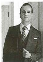
GREG NATALE GREG NATALE DESIGN

TEXT ELLE LOVELOCK