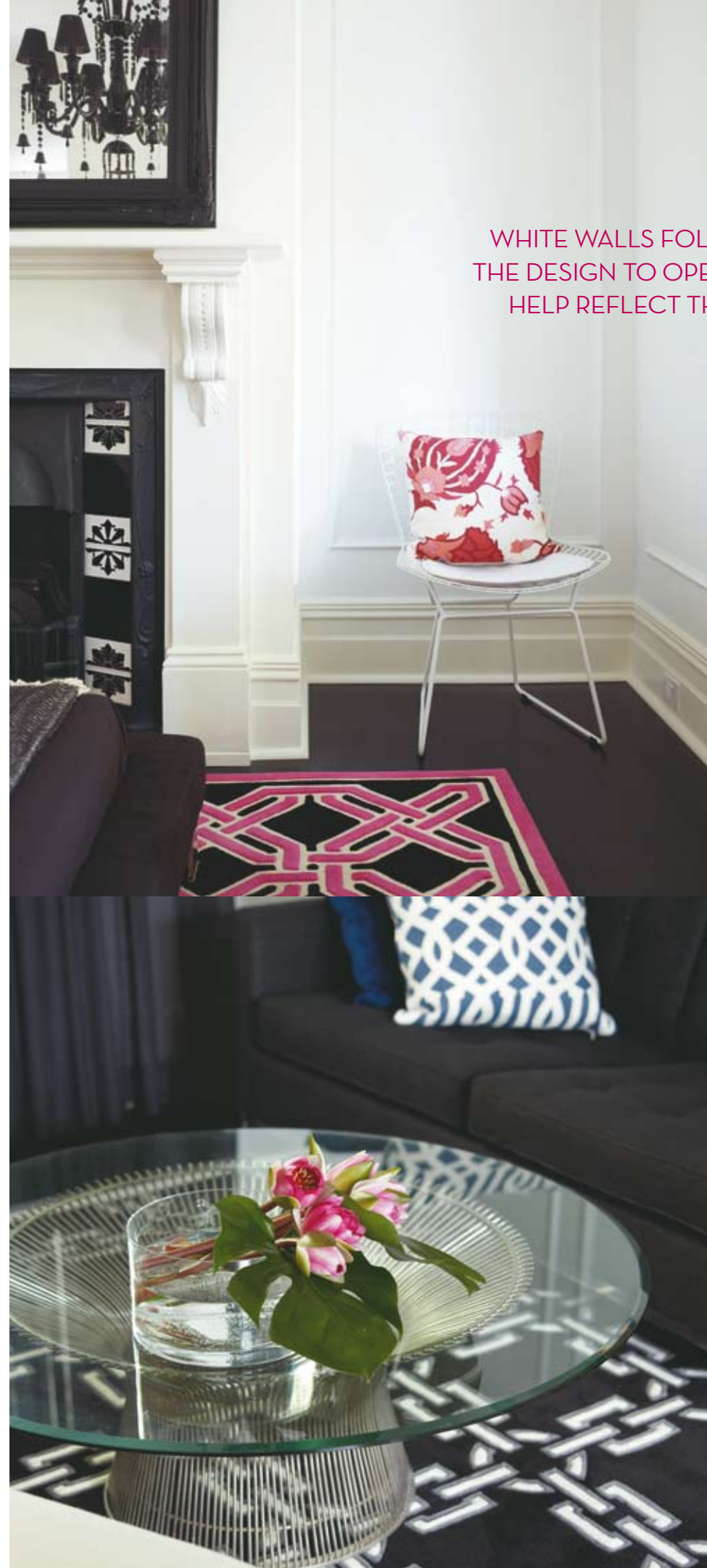
LEFT The eye-catching pink and black rug was designed by Greg Natale himself.