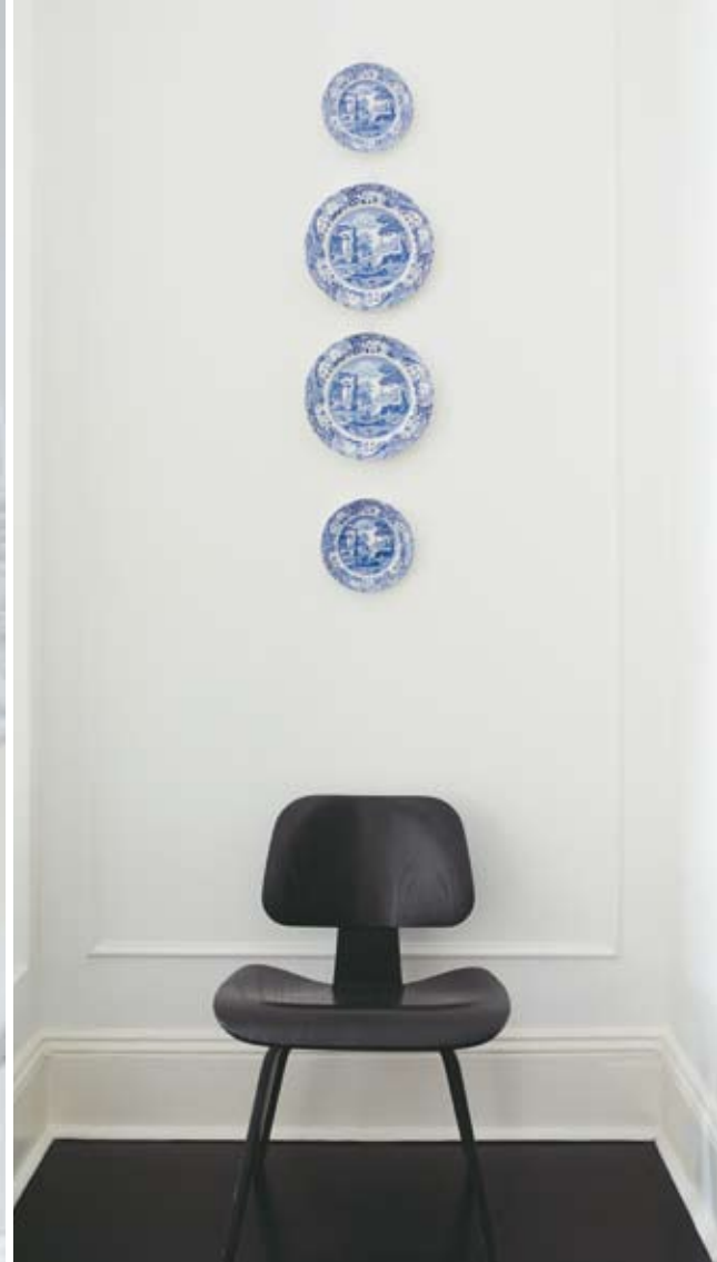
Classic Victorian architraves and mouldings adorn the entire home. RIGHT Greg always embraces both design and decoration when working on a project.

another unique first for Greg. Its textured result fits perfectly with the overall look of the space while breaking up the mass of black.