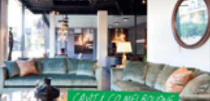
CAVIT & CO MELBOURNE