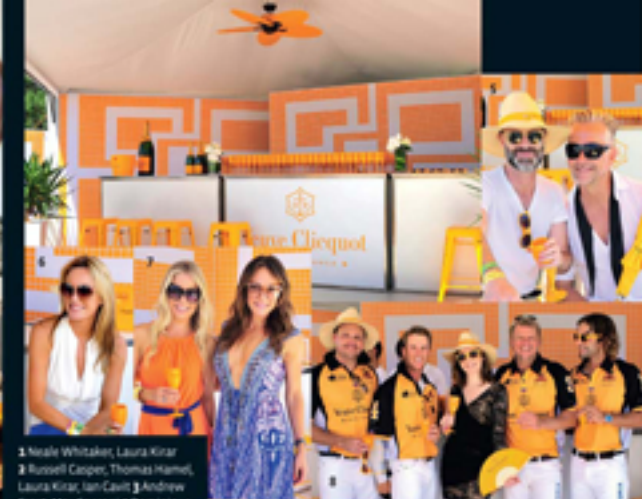
VEVVE CLICQUOT / PASPALEY POLO