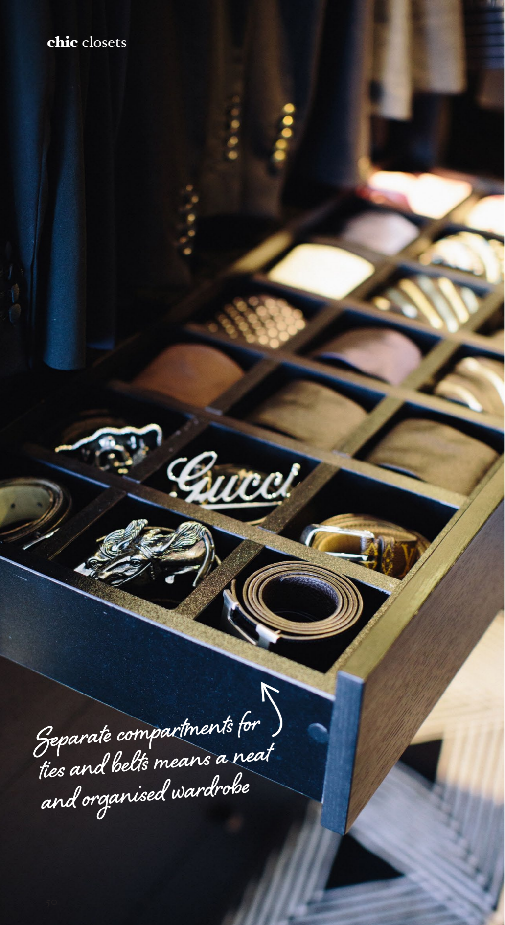
Separate compartments for ties and belts means a neat and organised wardrobe