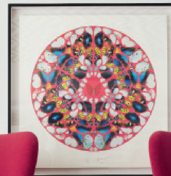
Two Wingback chairs by Tom Dixon reflect the hues found in the butterfly print by Damien Hirst

This, of course, was not as easy as it sounds. For starters, each of the artworks is different. Some pieces, such as the David Bowie picture by Mr Brainwash, feature pinks and gold, while the Marilyn Monroe piece is purely monochromatic. Not only this, the homeowners have very different tastes. The man of the house (who most of the pop-art pieces belong to) loves the contemporary look, whereas the lady of the manor prefers a much more classical look. V