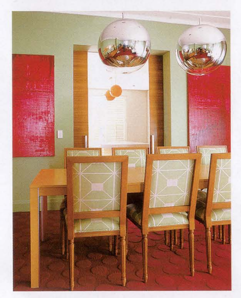
Left A beech table that extends to seat up to 12 people blends with the fabric-covered chairs and a raspberry-coloured carpet. Right The retro theme continues into the kitchen and casual dining room.